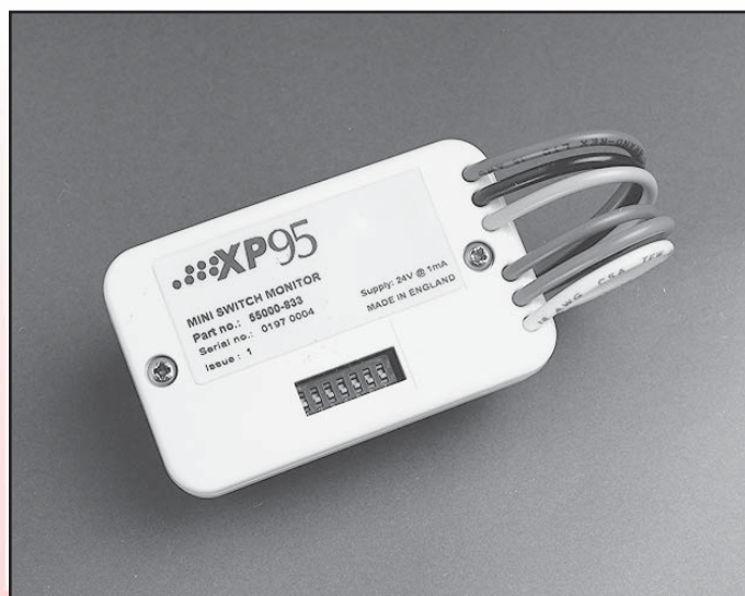
Part no: 55000-833

The control equipment transmits a 10-bit message to the Mini Switch Monitor.