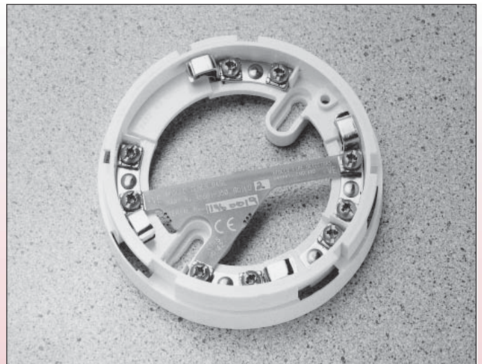
Part no 45681-350

*Patent no. GB 2069205, held by Protector Alarms Ltd, England