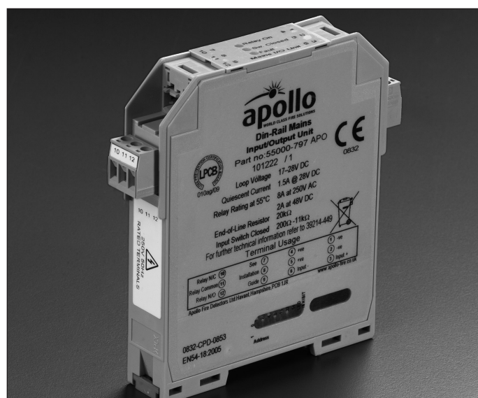
Part no 55000–797

Connections are made via plug in terminal blocks which accept wires up to 2.5mm 2 .